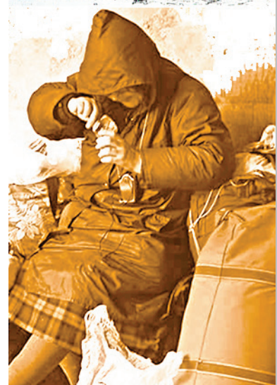
Ten Year Plan to End Homelessness