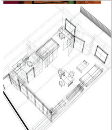
Wireframe Isometric of Living Space