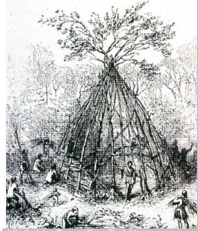
Viollet-le-Duc - The First House