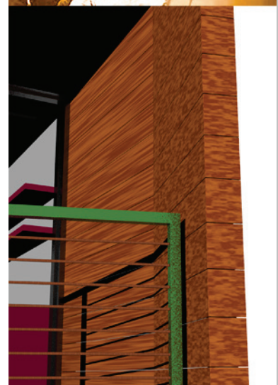
Exterior Materials Palette